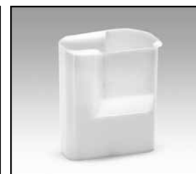
Cleaning Container 7005P