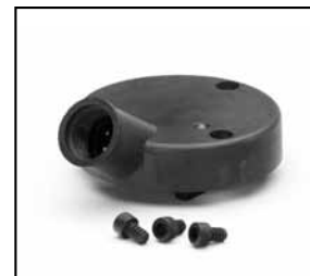
Control Head 7006P