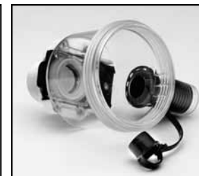
Chlorinator Housing 7008P