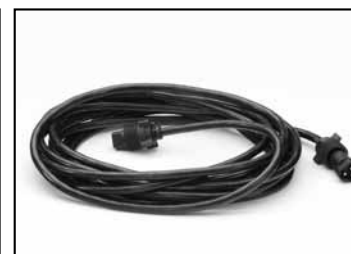
Power Cable 7003P